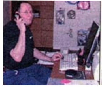
by Eli Heath Paige Computer Services

Some people are still using Windows 7 which is no longer supported as of January 14 2020. There are ways you can upgrade your Windows 7 computer for free to Windows 10. Here is the procedures thanks to Alison Denisco Reyome of C/NET;