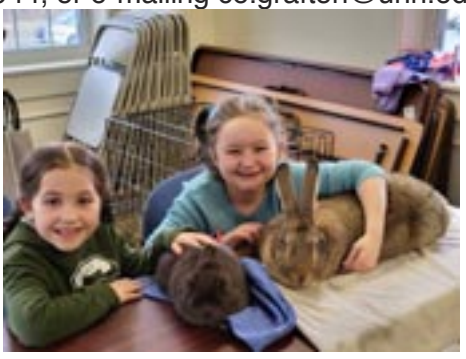
Bunny Basics 4-H SPIN – March 2022

787-6944, or e-mailing ce.grafton@unh.edu.